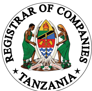
PRINC ASST. REGISTRAR OF COMPANIES

having, with sanction of a special Resolution of the said company, and with the approval of the Registrar signified in writing Changed its name, is now called GHANEC LIMITED and I have entered such new name on the Register accordingly this 29 th day of SEPTEMBER, TWO THOUSAND AND TWENTY TWO.